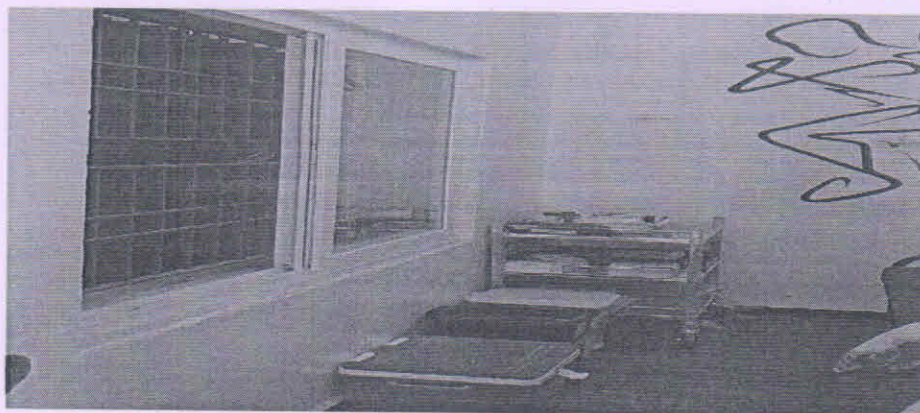
First Aid Facilities

First Aid Facilities: First Aid facilities are available in all academic blocks, providing immediate medical attention in case of emergencies. Our first aid team is trained to respond to emergencies and provide basic life support.